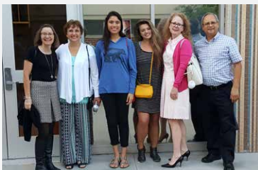
Southern California Chapter enjoyed their outing to Fullerton College

Heidelberg University Presented at the Germany Grad Fair in May