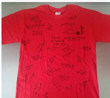
First HAUS National meeting T-Shirt from 2008 signed by alumni

You may have seen that the very first HAUS National Meeting T-Shirt from 2008 has been on quite the cross-country road trip to gather alumni signatures! It started in the Big Apple, then was off to Sacramento, Chicago, Columbus, and then stopped over in sunny LA. If you missed it in your neighborhood you can make your mark at the Anniversary meeting in New York.