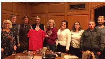
Chicago alumni with the famous HAUS T-Shirt!