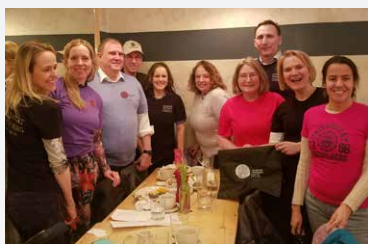
Post-brunch New Yorkers in T-Shirts from previous National Meetings

Heidelberg University Presented at the Germany Grad Fair in May