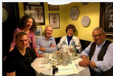
Northern California alumni at Café Marika in Sacramento

Heidelberg University Presented at the Germany Grad Fair in May