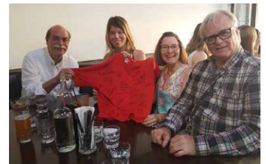
HAUSler in LA signed the T-Shirt before seeing Berthold Brecht's play.