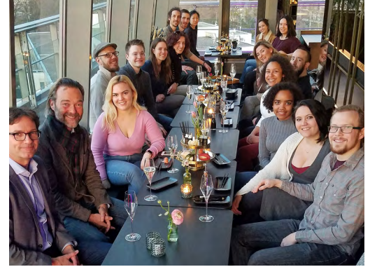
Heidelberg HAUS welcomes spring!