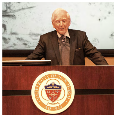
Nobel Laureate Dr. Harald zur Hausen speaking in San Diego

Good news for everyone who missed the talks: the embargo on his Heidelberg Lectures was lifted recently. Now, we are delighted to share the video. Watch the Heidelberg Lecture from San Diego here .