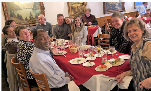
DC HAUSlers welcoming the holiday season

HAUS DC got an early festive seasonal start and met for a Holiday Luncheon at Old Europe, Washington's premiere German restaurant in the heart of downtown in December. Alumni reminisced about the Heidelberg Weihnachtsmarkt while enjoying delicious German food and each other's company during the early afternoon event —both old and new faces alike.