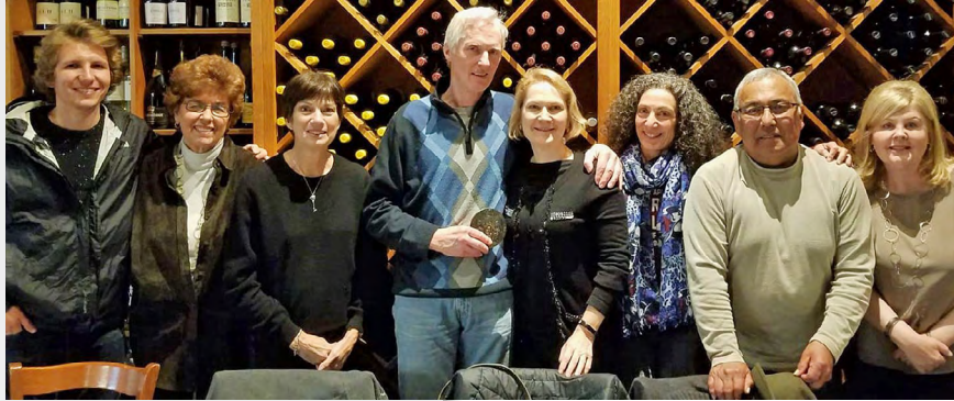
Northern California HAUS members meet for wine (and food!)