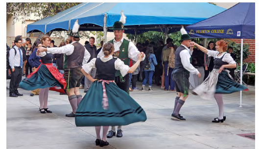
Schuhplattler at the German Cultural Event at Fullerton College

HAUS SoCal hosted an evening event in Los Angeles in January to kick off the New Year. Attendees braved some heavy rains to meet at the Wirtshaus restaurant on LaBrea Avenue. Over lively discussion and fond memories, the group enjoyed a delicious and authentic Schnitzel dinner, noting a desire to return for another such event at that location.