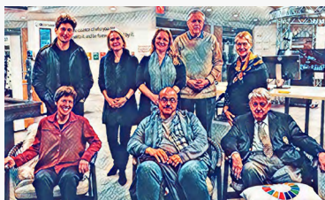
Group photo at HPI with effects from an app developed in partnership with HPI!